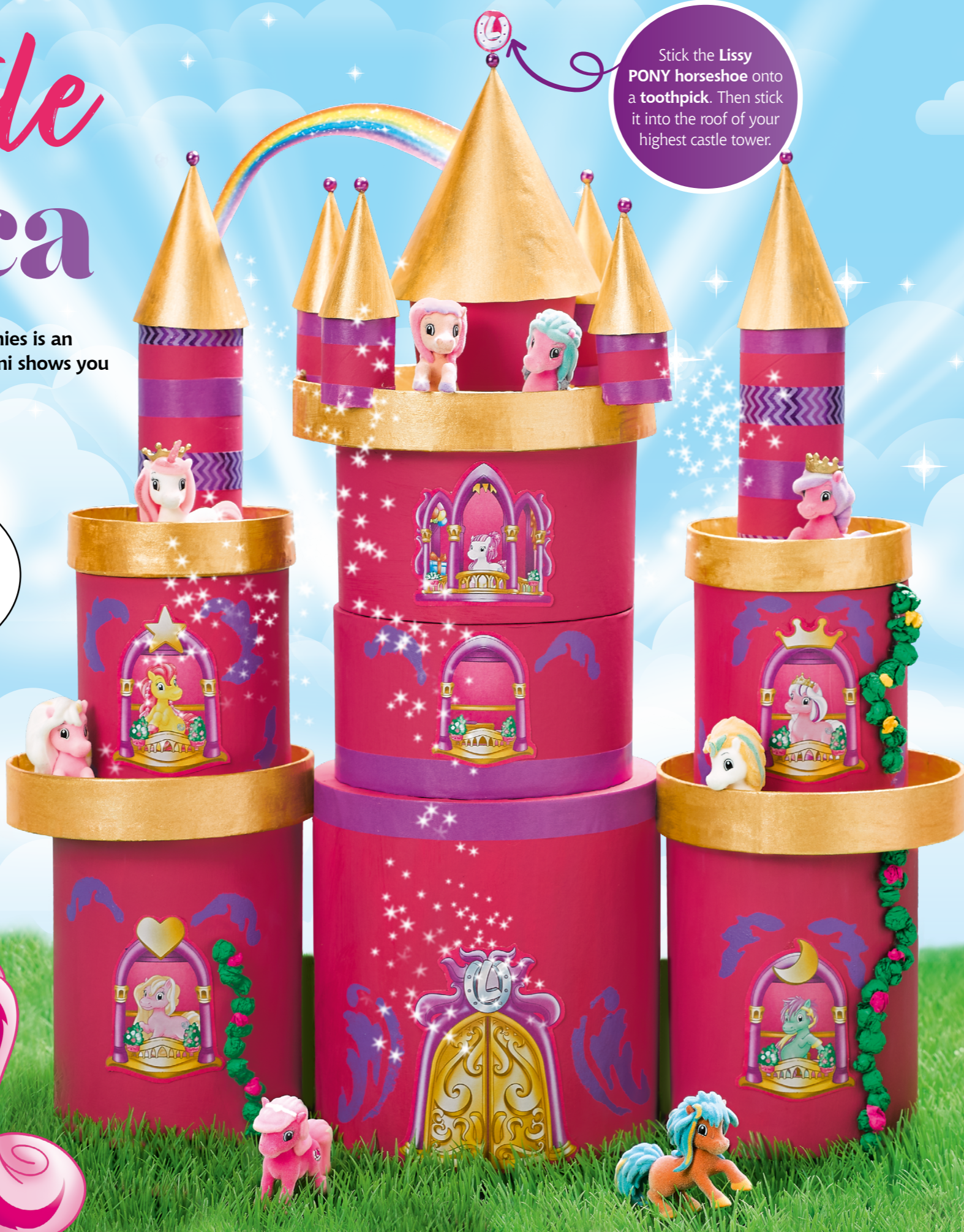
illustrations instructions: Kristina Stroh.

Stick the Lissy PONY horseshoe onto a toothpick. Then stick it into the roof of your highest castle tower.